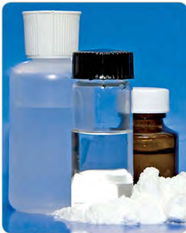
Vials containing GHB