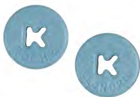
Klonopin 5mg tablet

Generally, legitimate pharmaceutical products are diverted to the illicit market. Teens can obtain depressants from the family medicine cabinet, friends, family members, the Internet, doctors, and hospitals.