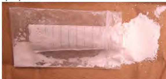
Opioid powder U-47700.