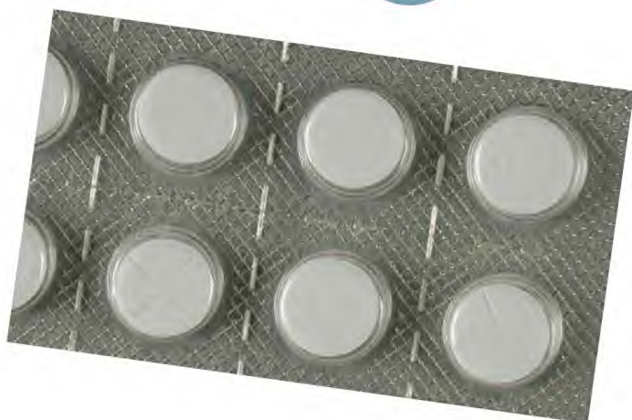
Blister pack of Rohypnol tablets