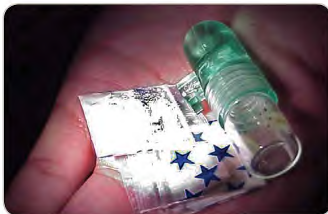
Ketamine in various forms

Other hallucinogenic drugs such as LSD, PCP, and mescaline can cause hallucinations. There are also several drugs such as GHB, Rohypnol, and other depressants that are misused for their amnesiac or sedative properties to facilitate sexual assault.