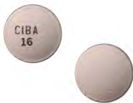
Ritalin SR 20mg tablet

Stimulants are diverted from legitimate channels and clandestinely manufactured exclusively for the illicit market.