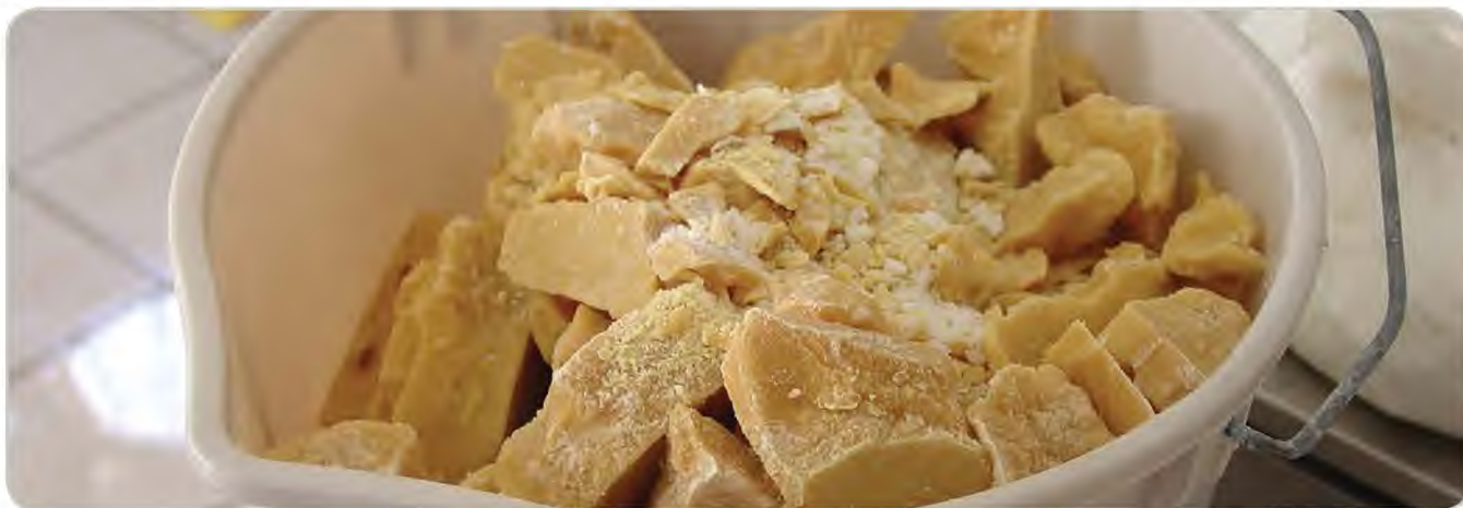
Methamphetamine in finished form

Such paranoia can result in homicidal or suicidal thoughts. Researchers have reported that as much as 50 percent of the dopamine-producing cells in the brain can be damaged after prolonged exposure to relatively low levels of meth. Researchers also have found that serotonin-containing nerve cells may be damaged even more extensively.