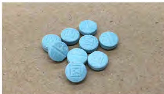
Clandestinely produced counterfeit oxycodone tablets that contain fentanyl.

Abuse of clandestinely produced synthetic opioids parallels that of heroin and prescription opioid analgesics. Many of these illicitly produced synthetic opioids are more potent than morphine and heroin and thus have the potential to result in a fatal overdose.