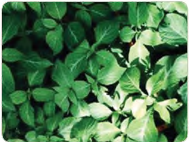
Leaves of the salvia divinorum plant

Neither Salvia divinorum nor its active constituent Salvinorin A has an approved medical use in the United States. Salvia is not controlled under the Controlled Substances Act. Salvia divinorum is, however, controlled by a number of states. Since Salvia is not controlled by the CSA, some online botanical companies and drug promotional sites have advertised Salvia as a legal alternative to other plant hallucinogens like mescaline.