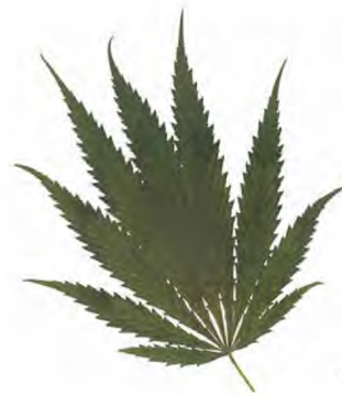
Leaf of marijuana plant

Hashish (hash) consists of the THC-rich resinous material of the cannabis plant, which is collected, dried, and then compressed