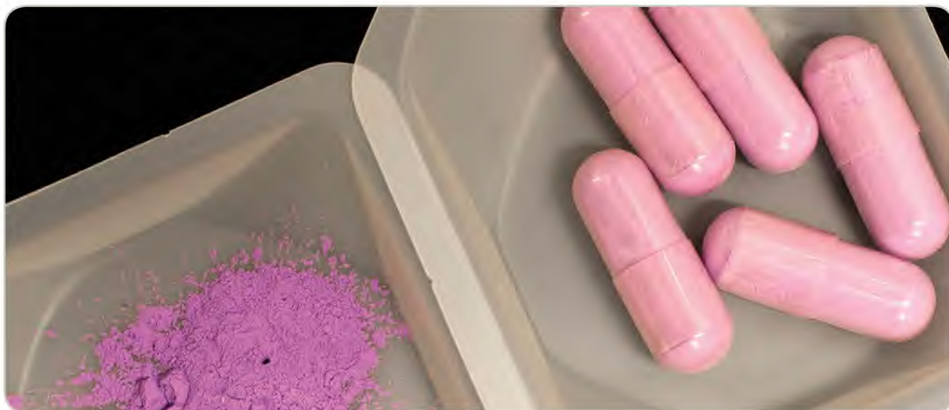
LSD powder and capsules

colors seem to change and take on new significance. Weeks or even months after some hallucinogens have been taken, the user may experience flashbacks — fragmentary recurrences of certain aspects of the drug experience in the absence of actually taking the drug. The occurrence of a flashback is unpredictable, but is more likely to occur during times of stress and seems to occur more frequently in younger individuals. With time, these episodes diminish and become less intense.