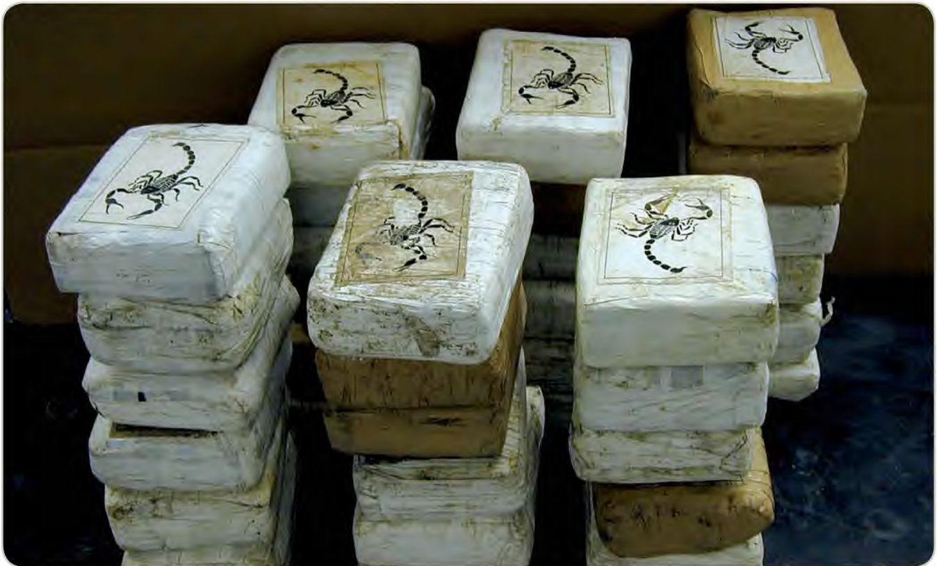
Cocaine bricks, seized by DEA

Cocaine is a Schedule II drug under the Controlled Substances Act, meaning it has a high potential for abuse and has an accepted medical use for treatment in the United States. Cocaine hydrochloride solution (4 percent and 10 percent) is used primarily as a topical local anesthetic for the upper respiratory tract. It also is used to reduce bleeding of the mucous membranes in the mouth, throat, and nasal cavities. However, better products have been developed for these purposes, and cocaine is rarely used medically in the United States.