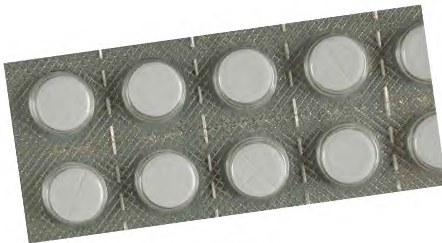
Blister pack of Rohypnol tablets

Rohypnol is a Schedule IV substance under the Controlled Substances Act. Rohypnol is not approved for manufacture, sale, use, or importation to the United States. It is legally manufactured and marketed in many countries. Penalties for possession, trafficking, and distribution involving one gram or more are the same as those of a Schedule I drug.