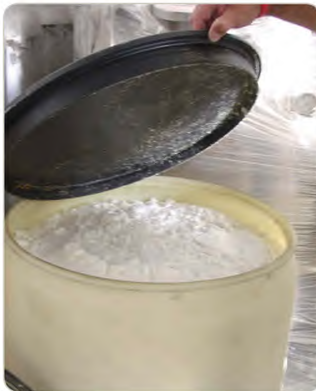
Methamphetamine in finished form

Meth is swallowed, snorted, injected, or smoked. To intensify