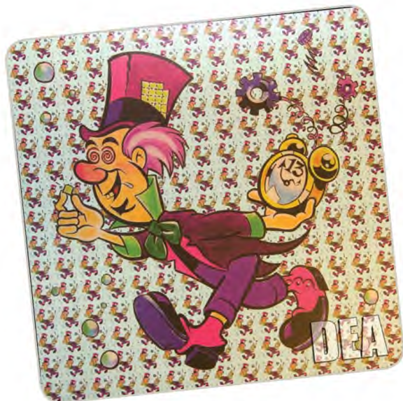
LSD Blotter Sheet