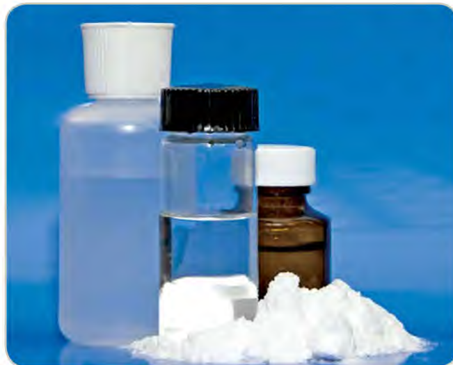
Vials containing GHB

Prolonged use of depressants can lead to physical dependence even at doses recommended for medical treatment. Unlike barbiturates, large doses of benzodiazepines are rarely fatal unless combined with other drugs or alcohol. But unlike the withdrawal syndrome seen with most other drugs of abuse, withdrawal from depressants can be life threatening.