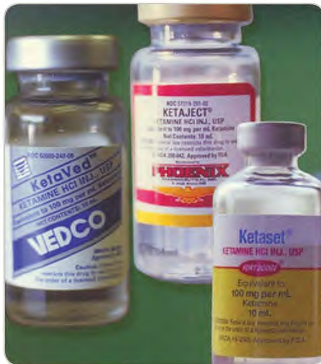
Vials containing liquid ketamine

Ketamine comes in a clear liquid and a white or off-white powder. Powdered ketamine (100 milligrams to 200 milligrams) typically is packaged in small glass vials, small plastic bags, and capsules as well as paper, glassine, or aluminum foil folds.