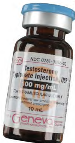
Testosterone Cypionate Injection, USB