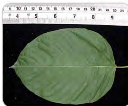
Leaf of kratom tree